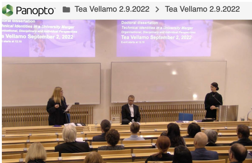
Figure 2. Screenshot from a Streamed Public Defence

Both the public defences organised onsite and those utilising remote technology have potential for success (Allen & Williams, 2022). The prestige and outcome of the event depends on many factors, including the preparation, knowledge of the context and the medium, communication skills, and attitude. For example, mediated immediacy (e.g., approachability, nonverbal warmth, friendliness) in general can be achieved by the equal frame size and close-ups on remote defences to support interpersonal communication (Kuuluvainen et al., 2021, 2023). To ensure a ceremonious academic atmosphere the facilities and amenities such as microphones, Wi-Fi connections, and virtual backgrounds need to be planned and tested beforehand (for guidelines, Allen & Williams, 2022).