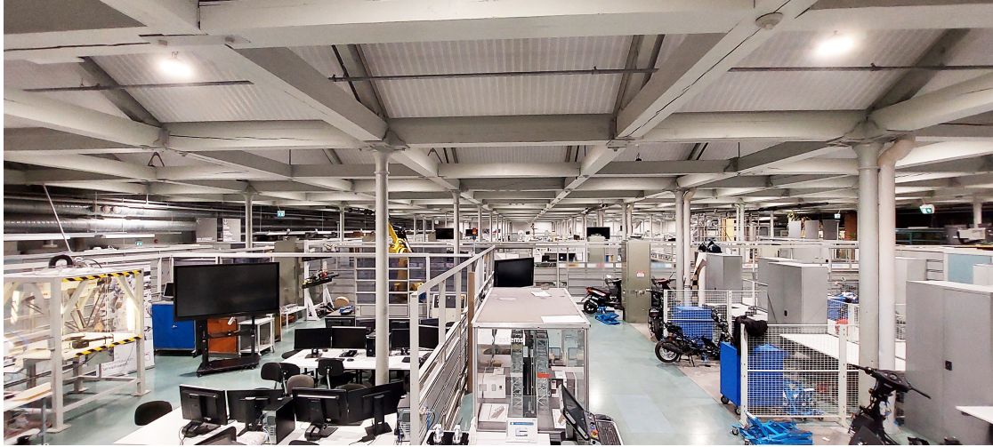
Figure 1: Technobothnia laboratory, a dense industrial environment situated in Vaasa, Finland.

chairs, machines, and tools, besides other materials as concrete walls, wooden structures, etc. as shown in Figure 1.