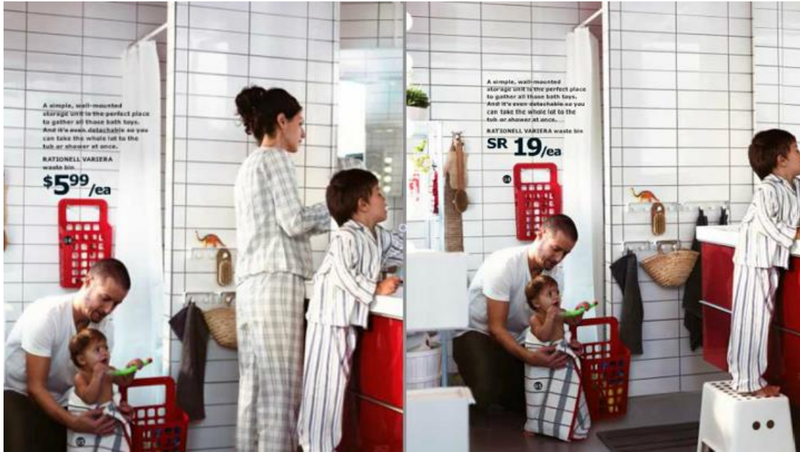
Picture 1. Ikea removes women from the Saudi Arabian catalogue. ( Ikea 'regrets' removal of women from Saudi catalogue , 1 st October 2012, bbc.com )