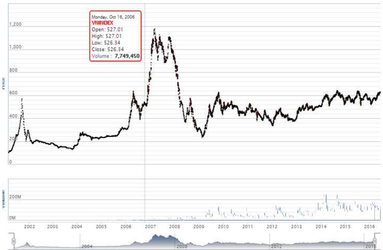
Chart 1. VN index history price and trading volume