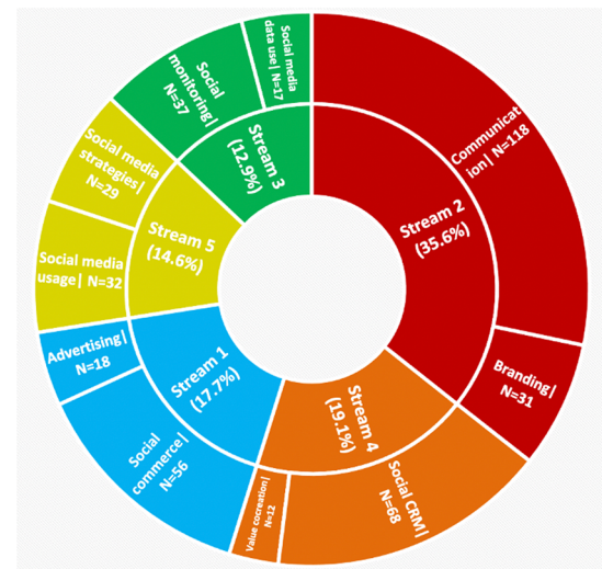
FIGURE 2 Evolution of social media marketing research.