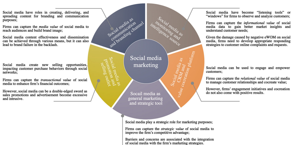
FIGURE 3 Key findings for each stream of social media marketing research.

Second, building on the value creation perspective, and taking into consideration the two constituent parts of social media marketing (i.e., social media and marketing), we propose an organizing framework that comprises five distinct research streams. These streams were determined based on the different key roles played by social media and the values that firms can capture from social media. This categorization has proved useful in effectively guiding, organizing, and systematically analyzing the disjointed nature of the social media marketing literature, as well as facilitated the identification of areas for further convergence, consolidation, and refinement. In particular, our review has helped to enrich understanding of