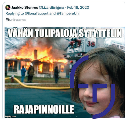
Figure 3: Version of the disaster girl with tuninaama

Note: The text reads: “I lit up wee fires on interfaces.”