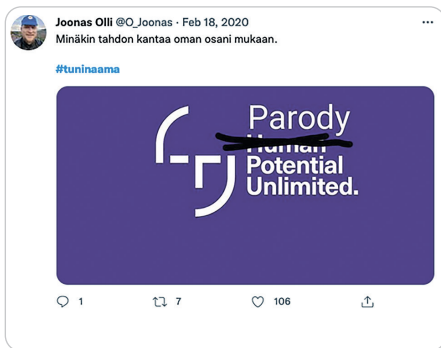
Figure 4: Tuninaama variation where the "Human potential unlimited" slogan is modified

According to Wiggins (2019), memes are used for constructing identities and raising self-esteem, but they also help bring marginal issues to broader attention, which also happened in the Tampere University case. Overall, while the main point of the visual variations was satire and parody, many of the tweets shared a more serious and critical undertone: Twitter users resisted the style and tone of Tampere University communications, which was seen