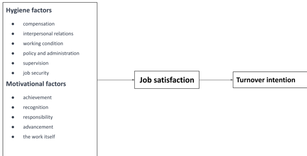
Figure 3: Theoretical framework