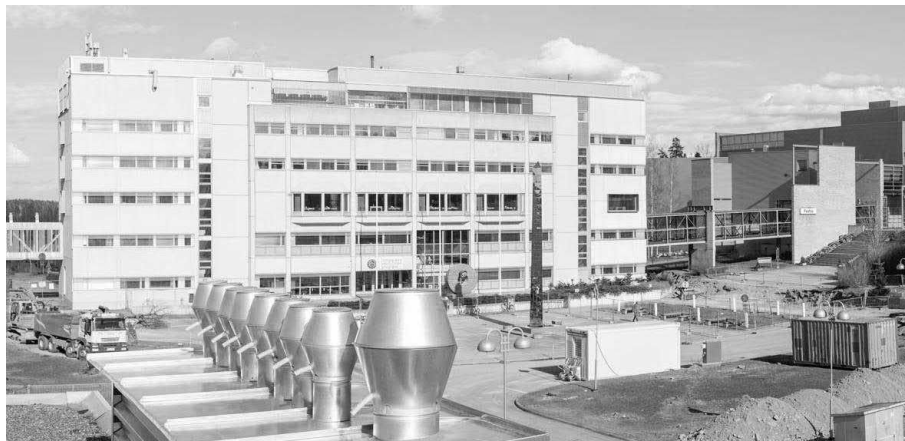
Fig. 4. New building and renovation projects for developing further the campus of Tampere University of Technology are the objects of the current action research efforts.

Variety of research themes are present inside the different projects listed above. Examples of those are: