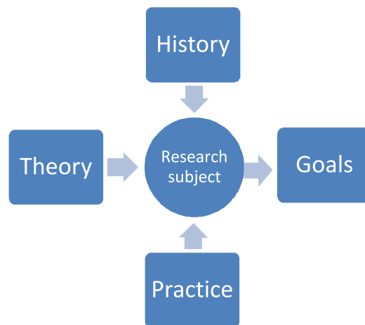
Fig. 2. View of the research subject according to action-analytical research strategy (Olkkonen 1993: 56).

Although there are many important paradigmatic differences between e.g. qualitative and quantitative, there are some similarities between the various approaches. According to Sechrest and Sidani (1995, p. 78) both methodologies “describe their data, construct explanatory arguments from their data, and speculate about why the outcomes they observed happened as they did.” Additionally, both sets of researchers ensure that their inquiries have minimum confirmation bias and other sources of invalidity (or lack of trustworthiness) that have the potential to exist in every research study (Sandelowski, 1986).