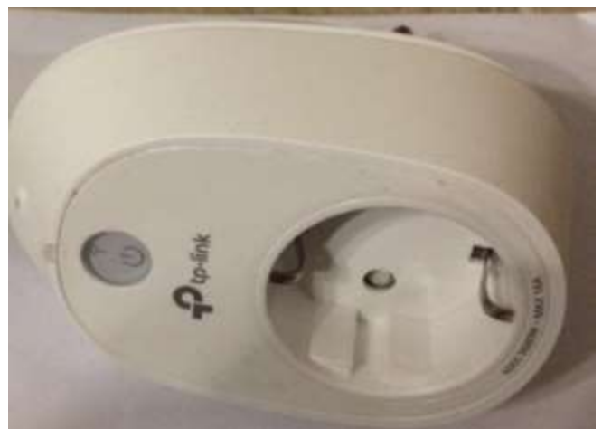
Figure 4. Kasa Smart Wi-Fi Plug with Energy monitoring .

The Kasa Smart Wi-Fi smart plug is shown in Fig. 4. A Wi-Fi home network is required for it.