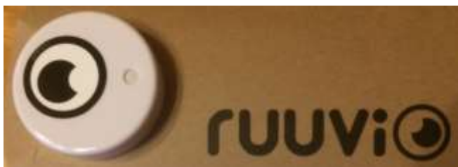
Figure 2. RuuviTag sensor station

Fig. 2 show an ordered RuuviTag sensor which position can be easily changed. It provides data about temperature, humidity, and pressure. It has a free app; Fig. 3 shows an example of screen shot of app screen. The sensor was placed in a study room.