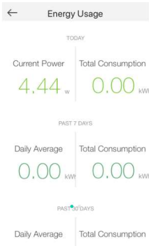
Figure 5. An example screen shot of Kasa Smart Wi-Fi Plug app user interface.

It has a smartphone app which provide help for connecting. With this app, the user can monitor electricity usage. Fig. 5 shows an example of screen shot. The screen shot shows short term electricity consumption of a laptop.