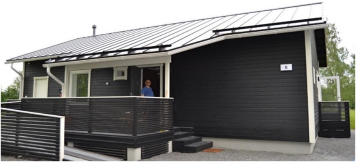
Figure 5. Ecohouse is using solar energy, storing it as geenergy into energy piles under the building and using it after seasonal storing.

Block house. There are 2 similar apartment houses with 8 floors in Suvilahti, Vaasa (Fig. 6). They are utilizing geothermal and solar energy for the heating. There are 14 boreholes with depth of 200 meters of each around one building and 10 boreholes around another. The geothermal energy was already used for heating at the building stage to accelerate the drying process of structures. There are 33.6 m 2 of solar collectors on the roof of each block house. The solar energy is stored to the boreholes to increase the temperature of heat carrier fluid. Later the aim is to produce the hot service water of the building by the solar energy too. The buildings are now self-sufficient in heating energy. The apartment houses have a common heat distribution room where are 2 heat pumps; a 60 kW main pump and a 40 kW relay pump. [9].