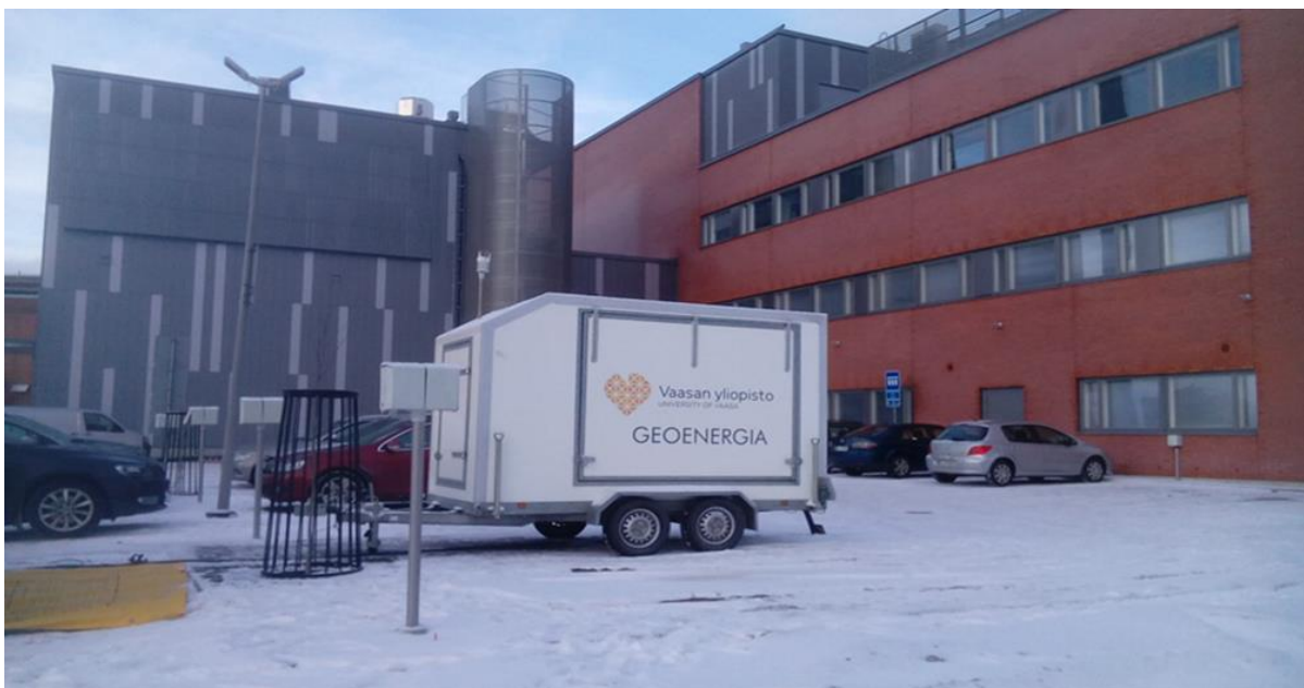
Figure 8. EnergyLab building is heated by geothermal energy from the boreholes. Thermal Response Test (TRT)-trailer is monitoring one research borehole in the yard. Research borehole will be joined to bedrock heat battery in future.

Office/laboratory building. EnergyLab, an energy laboratory building, was built in the campus area of University of Vaasa in 2017. The main heating system is 18 boreholes each 270 meters deep. A future plan is to utilize the industrial waste heat from internal combustion engine laboratory, the heat of the cooling water of the engines. This heat would be transferred to the seasonal storage into a bedrock heat battery (Fig. 8). The EnergyLab building is actually a CHP unit producing electricity too.