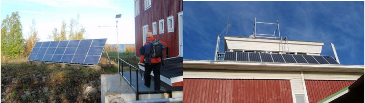
Figure 4. On island Mikkelsaaret part of the solar panels are assembled on the ground and a part to the wall of the observation tower.

On island Mikkelsaaret has also been used hybrid solution of the solar panels and a wind turbine. The solar panels have been placed both on the ground and on the roof of the main building (Fig. 4). The solar panels are working properly. The wind turbine was erected on the ground close to the main building. Also in this solution problems existed with the endurance of the wind turbines. It seems that circumstances on these islands are very challenging for small wind turbines.