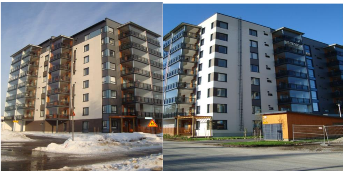
Figure 6. Block houses in Suvilahti Vaasa use geothermal and solar energy. [9]

Block house. There are 2 similar apartment houses with 8 floors in Suvilahti, Vaasa (Fig. 6). They are utilizing geothermal and solar energy for the heating. There are 14 boreholes with depth of 200 meters of each around one building and 10 boreholes around another. The geothermal energy was already used for heating at the building stage to accelerate the drying process of structures. There are 33.6 m 2 of solar collectors on the roof of each block house. The solar energy is stored to the boreholes to increase the temperature of heat carrier fluid. Later the aim is to produce the hot service water of the building by the solar energy too. The buildings are now self-sufficient in heating energy. The apartment houses have a common heat distribution room where are 2 heat pumps; a 60 kW main pump and a 40 kW relay pump. [9].