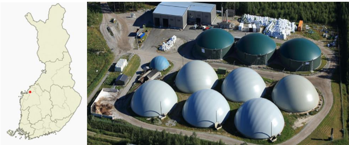
Figure 10. Jeppo municipality has an area with biodiesel plant, biogas plant and filling station of compressed biogas. (Jeppo Biogas)

Municipality. Jepua is a village situated in the Ostrobothnia region and is one of the few energy villages in Finland. The municipality has a special area having a biodiesel plant, biogas plant and a filling station of compressed biogas. (Fig. 10) They also have their own micro grid. For energy production there are used biomaterials from their own region. Also the biodiesel and biogas are mainly used on their own area. This area is an excellent example of area producing and using near energy and an example of industrial symbiosis too.