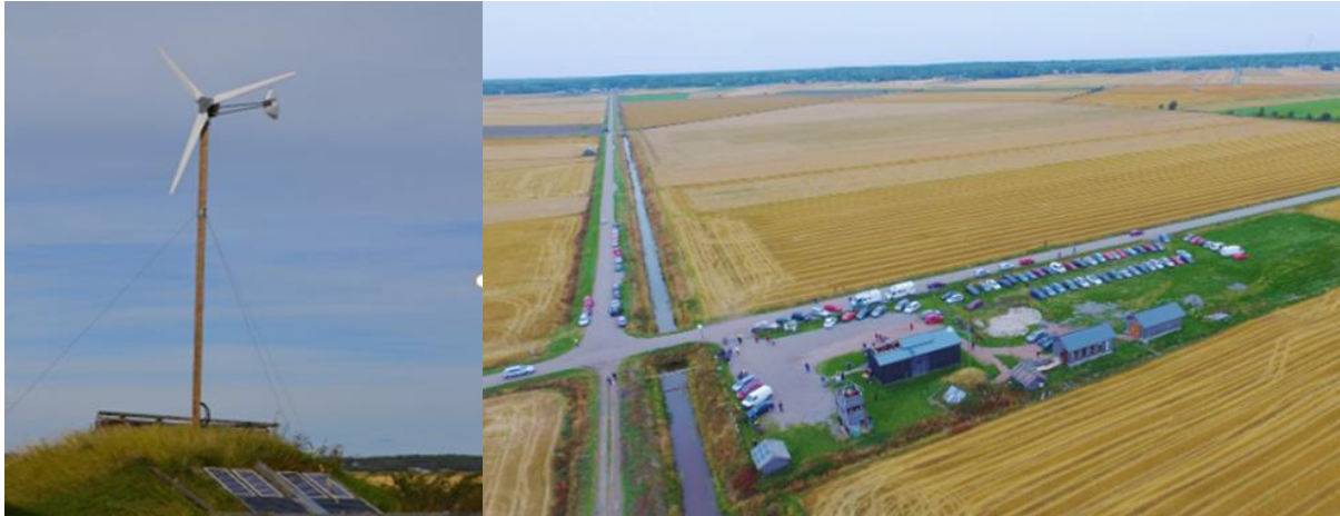
Figure 2. Meteoria is producing power by the 4 kW wind turbine, by solar cells and by solar air heating collectors. Meteoria is an energy self-sufficient museum area.

Meteoria is a self-sufficient museum area. Power and heat to the museum building are produced in the “energy cellar” by using 1.5 kW solar cells and a wind turbine of 4 kW, (Fig. 2). “Energy cellar” is planned in co-operation with University of Vaasa. Energy from solar panel and wind turbine covers over 90 % of all activities in the museum area. The load following power is produced by an internal combustion engine (11 kW) fueled by biodiesel. The wind turbine consists of three blades, length 2.5 m. The produced energy is stored in the 12 batteries (12 V/200 Ah). The maximum energy is 30 kWh.