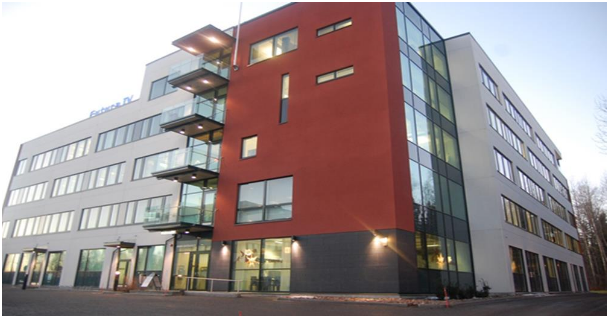
Figure 7. Futura IV office building uses renewable hybrid technology in the heating and cooling system.

technology integrates the geothermal energy and district heating. The geothermal energy is a primary heat source. The system has 8 boreholes each 280 metres deep. District heating is used as backup system.