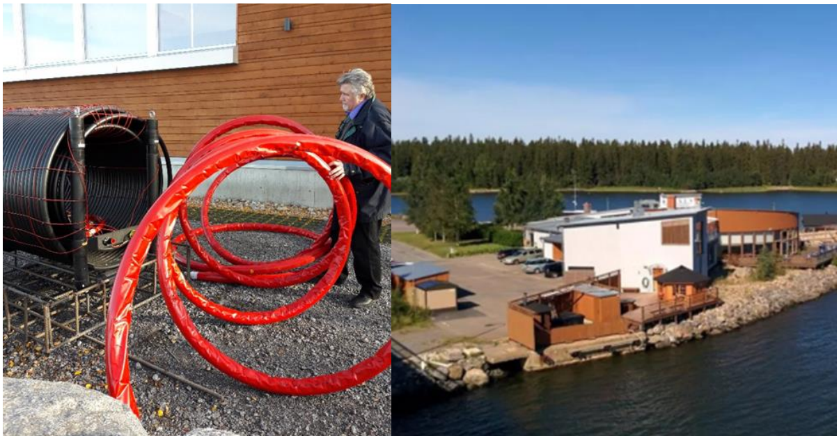
Figure 3. The assembling of water heat exchanger in Kvarken World heritage gate building implemented by renewable energy research group (University of Vaasa) in the Autumn 2018.

Museum building. On the Kvarken World heritage gate there will be an exhibition house, which is planned to be heated and cooled partly by using seawater and a heat pump. The heat is collected by a water heat exchanger (Fig. 3) which has been sunk to the sea. In the summer the heat would be stored into the seasonal storage in the boreholes.