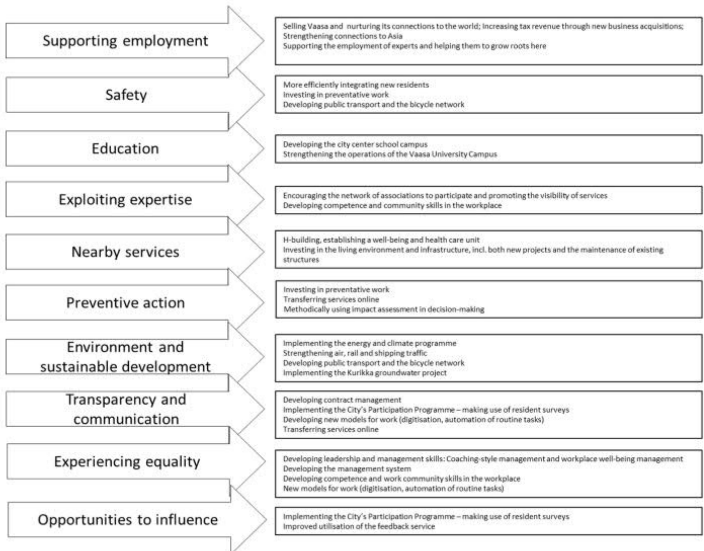
Figure 2. Connections between the top ten areas Vaasa should invest as defined by citizens and the strategic actions the city committed in its strategy work.