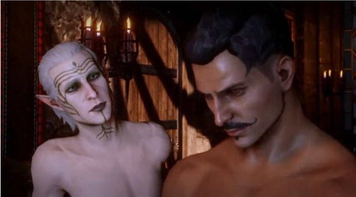
Figure 1. A screenshot from a fan-made video celebrating a romance between the player's elf character and Dorian Pavus from Dragon Age: Inquisition (El Doriango 2015).

This article takes the perspective of queer social interaction as a starting point to analyse how players of various kinds of role-playing games utilise the 'magic circle' of the game to explore romantic and amorous interactions, as well as questions of gender identity and sexuality. We also discuss instances where the game confounds its unsuspecting players, such as in the example above, by confronting them with unforeseen content. In this text, we ask how queerness appears in role-playing games: How does it affect the options for romance, is it localised in an event or the composition of a single character, what kind of exploration does it serve? Is queer to be found in the romance mechanic, or crunch, of RPGs, or is it part of the fluff: the setting and character descriptions (see Care Boss 2012)?