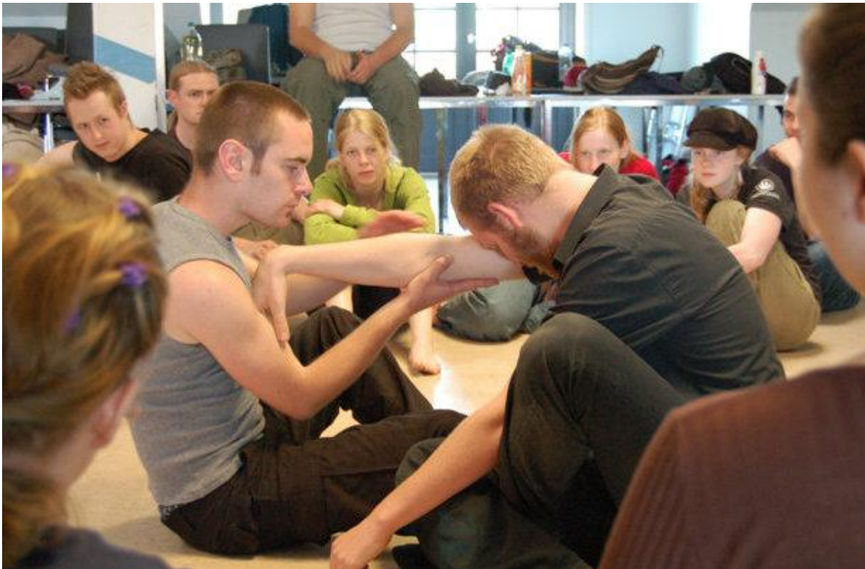
Figure 3. A demonstration of the Ars Amandi technique from the workshop that preceded the Danish larp Totem (2007).

In Mellan himmel och hav , both the mechanics and the setting – crunch and fluff – supported the portrayal of queer romances, foregrounding such themes as bisexuality and polygamy. However, the larp also went one step further and encouraged players to get comfortable with one another during two workshop weekends that preceded the actual larp play (multiple separate workshops were and are very uncommon). During the workshops, players participated in creating the world, developed their characters and the interpersonal relationships, and discussed the queer feminist ideology of the larp. Fostering interpersonal affordances was taken seriously; the participants thought of themselves as an ensemble, and other people in the larp scene half-jokingly called them a ‘cult’ (see Stenros 2010).