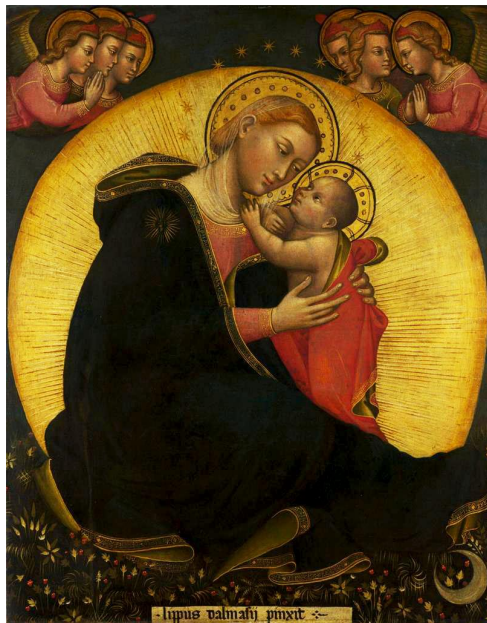
Figure 8. The Madonna of Humility. (Di Dalmasio 1390).

establishes a subjective female gaze that neither imitates, nor criticizes the male gaze (Tallman 1992: 153). At the same time as the lithograph works as a mirror for Smith, it communicates on a “universal level” blending the private and the public sphere (Wilkerson 2006: 68). In conclusion, the spiritual transformation and rebirth of the rising Phoenix conveyed in the work portray the private creating artist and the universal woman in spinning renewal, migration and change from darkness to light, from an underdog position to sway, all carefully rendered through a subjective female gaze.