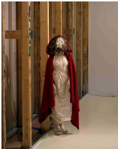
Figure 1. Daughter (Smith 1999a)

Shapeshifting, wonders, magic fables, fairytale and myth such is the world of Kiki Smith, a German born, American visual artist that is perhaps most famous for her numerous sculptures displaying female and animal bodies. Smith's artworks always communicate a feminist view of life, and among critics such as Jack Zipes (2012: 142), she is commonly associated with the feminist aesthetic practice. Marina Warner (2005: 44, 51–52) equates Smith with an elite storyteller known for seeking out the forbidden, the grotesque and the abject and then elegantly combining it with the noble and the beautiful in the artworks she exhibits. I will introduce the sculpture Daughter Figure 1. (see also Appendix 1. ) and the lithograph Born Figure 2. displayed on the next page (see also Appendix 2. ) first and then enter into a critical discussion of Smith's feministic endeavors in relation to the two artworks.