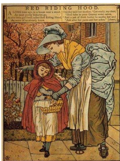
Figure 5. Warning from the Mother (Crane 2007b)

While only the formal qualities of the illustrative tradition seem to interest Smith, by alluding to the form, also the narrative content of this tradition is invoked. Zipes (1983-84: 84) explains that the meeting in the woods (see Figure 4. ) and the bedroom encounter ( Figure 3. on page 52) are two of the most frequently reproduced scenes from the tale. Besides the mutual gazing of the two characters, that implies a shared proximity, another interesting feature is the ample wolf, which completely overpowers the diminutive girl; an asymmetry that Smith breaks for instance in Born by reducing the wolf to its natural size and by making the two female characters exchange gazes instead. A third commonly reproduced theme from the Grimm version takes a moral standpoint, warning against disobedience (Zipes 1983-84: 84). This is beautifully rendered in Crane's illustration of Little Red Riding Hood with her basket and her mother pointing her index finger as to indicate the right path and already scolding the little girl with the lowered respectful gaze for misbehaving in Figure 5.