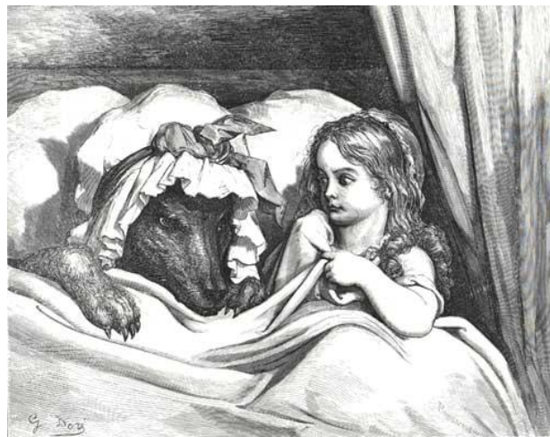
Figure 3. The Bed Encounter 1867 (Doré 2007a)

Thus, in a colorful blend drawing from various adaptations of “Little Red Riding Hood,” the spectator is faced with a vast array of scarlet visions. Visions that in cycles ripple out from the visual narratives to create spatial temporality that moves backward in time as well as forward, when the spectator forms her own narratives based on the intertextual material implied. But which intertextual and intermedial path is the audience then bound to follow? Actually, as many paths as you possible can manage to ensure the process of reducing your “creative identity” to zero, to reconstruct “a new plurality,” which, as Kristeva suggests, is an innate precondition for all aesthetic appreciation (Waller 1996: 190). If intertextuality as an aesthetic practice is interpreted in this way, especially in conjunction with Smith’s tales, fairytale iconography has to be contemplated upon as well.