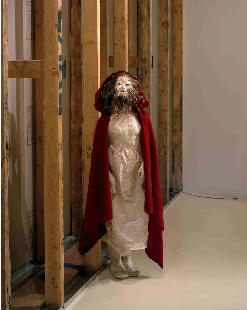
Figure 1. Daughter (Smith 1999)