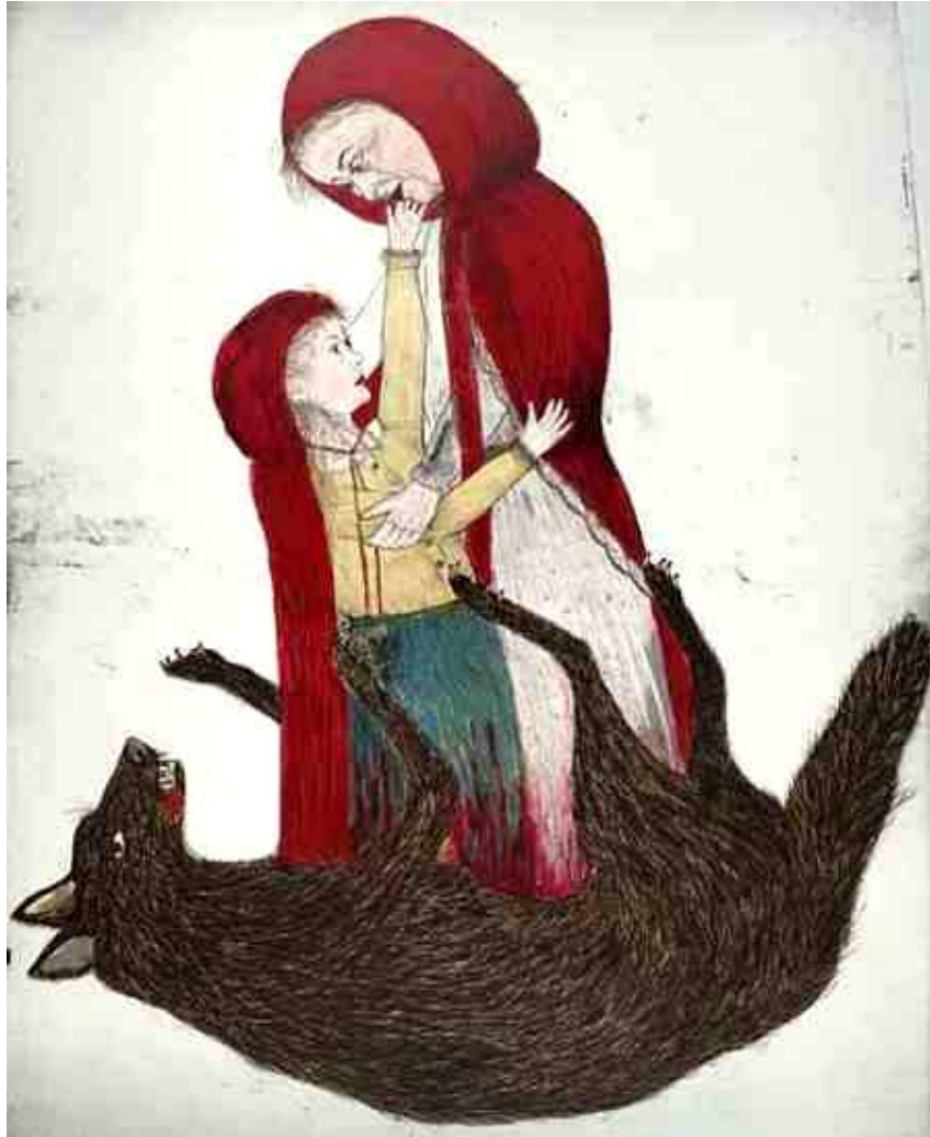
Figure 2. Born , edition 4 of 28 (Smith 2002)