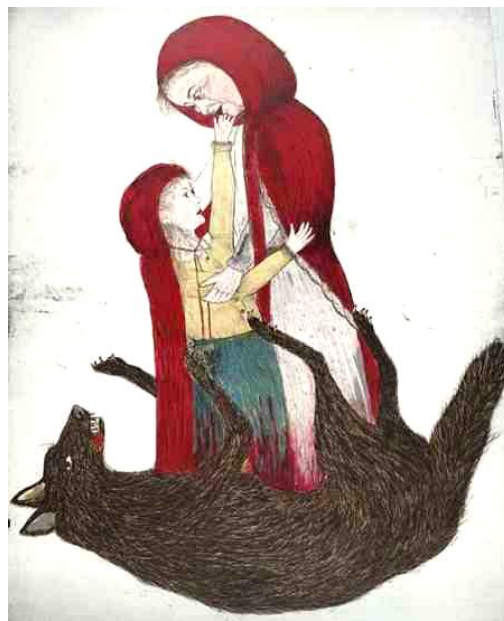
Figure 2. Born , edition 4 of 28 (Smith 2002)

The full round statue of Daughter measures 121, 9 centimeters in height and is executed in nepal paper, methyl cellulose, bubble wrap, fabric and hair (Sporre 2003: 55, 59). This working process is called additive, in which the artist adds miscellaneous material to create a physical mass. The color scheme is simple and constitutes mainly of large color fields of white, red and brown, which creates a bold yet tranquil appearance. The ankle long dress is shining white, so is the girl's hands, legs and feet. The face is all covered in brown, thick, furry hair. In all the whiteness the focal points of the blue glass eyes stand out together with the blood red hood that cloaks the petit entity. In exhibitions, Daughter has been accompanied by a motion-activated sound track especially composed by Margaret De Wys.