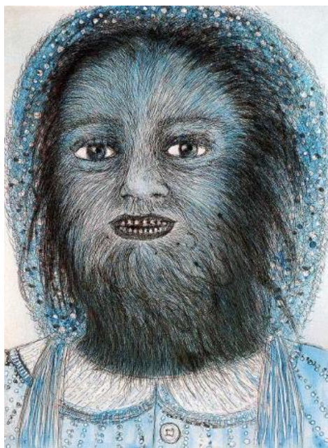
Figure 6. Wolf Girl (Smith 1999b)