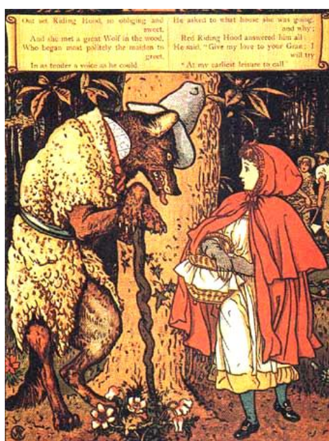
Figure 4. The Meeting in the Woods (Crane 2007a)

inspiration for Smith, which she perceives as both enduring and changing because while being continually repeated, as time evolves, new meaning is constantly created (Tillman 2005: 39). Whereas the artist claims to be inspired especially by Gustave Doré's illustrations of "Little Red Riding Hood" Figure 3 . (displayed on the previous page), when it comes to formal elements, there is also a close resemblance between Smith's visual narratives and Crane's illustrations, exemplified in Figure 4 . (Ventura 2005: 73). The illustration by Doré was first published in a French collection called Les Contes De Perrault in 1867. Crane published his illustrations in a retelling of the Grimm's tale called Little Red Riding Hood in 1875. The intertextual bond between Smith and Crane is prominent in the design and cut of the crimson hood and the white apron since Doré's girl is not cloaked in a hood but rather wears a beret. Undoubtedly, it is Smith's long-standing fascination and familiarity with fairytale iconography from the 19 th century that lends its outward form to Daughter and Born .