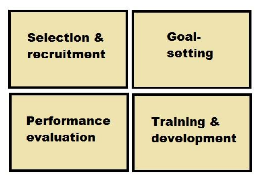
Figure 2. Performance management systems.

Previously mentioned hard components, performance appraisal and goal-setting, are the most important factors in expatriate performance management. Moreover, expatriates prefer structured performance appraisal and informal meetings with their supervisors monthly to discuss the results of their performance and to follow the progress. Furthermore, expatriates should participate in goal setting together with their immediate supervisor. (Ellis 2012; Woods 2003.)