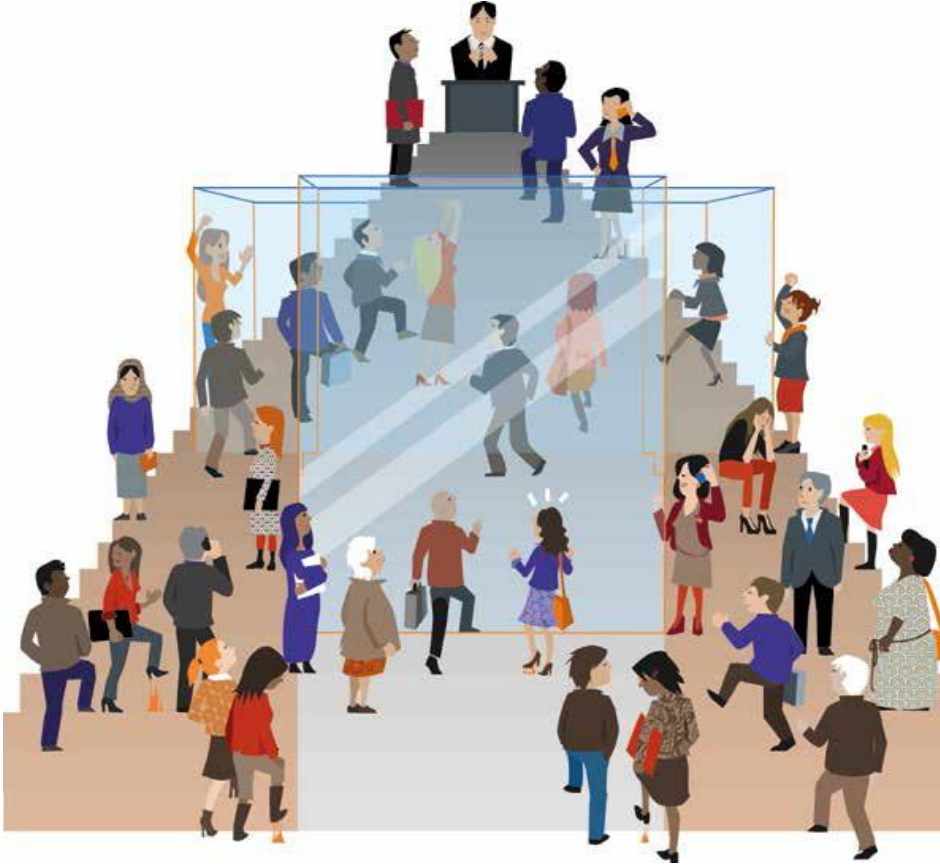
Figure 2. Gender based segregation in management occupations(ILO 2015:13)