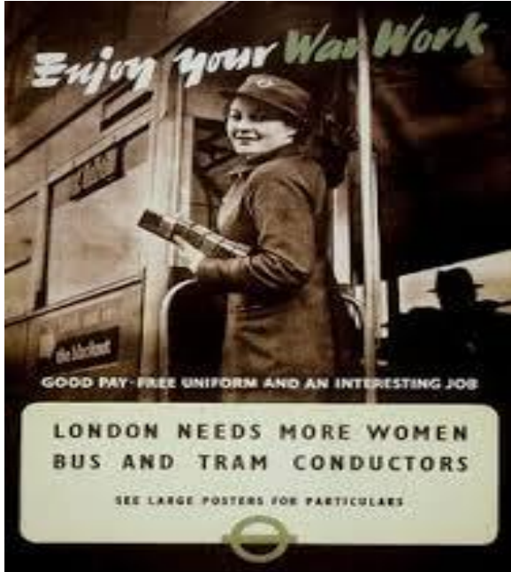
Figure 1 European woman working a transit job. https://www.pinterest.com/pin/109845678387280184/