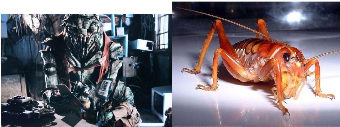
Example 8. The alien "prawn" of District 9 (District 9, chapter 14) and the "Parktown prawn" of Johannesburg (io9, 2009)

The appearance of the aliens of District 9 has its origins in reality. The humans have started to call the aliens "prawns", which they are even said to look like by an interviewed man. Their appearance has a strong resemblance to what is called "The Parktown Prawn", which is a common unwanted pest in Johannesburg's gardens (Intekom 1999). The following example 8 demonstrates the similarity between the alien "prawn" and the "Parktown Prawn".