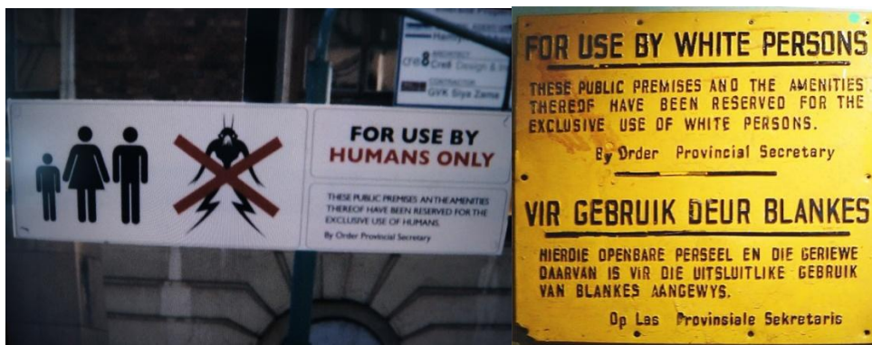
Example 5. A sign from District 9 and a sign from the apartheid era ( District 9 , chapter 2) (juggle)

Before the above mentioned "Native Resettlement Act", the South African "Parliament passed the Reservation of Separate Amenities Act" in 1953 to legalise the unequal segregation of different racial groups in public facilities such as waiting rooms or railroad stations (Thompson 2001:190). Signs for "Whites only" and "Non-Whites only" "appeared on facilities ranging from train cars to park benches" (Beck 2000: 128). District 9 has addressed this correspondingly by assimilating the aliens to black people during the time of apartheid. The next example illustrates an unquestionable link between the apartheid reality and the reality in District 9 .