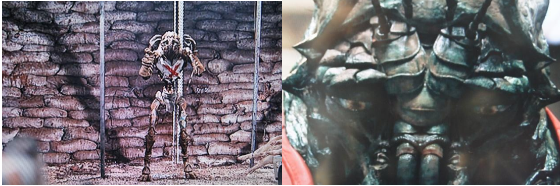
Example 9. A scared alien and a thoughtful sad alien (District 9, chapter 7 and 12)

who has just found out that his fellow aliens are tested on such a way and stands watching the dead body of one of them.