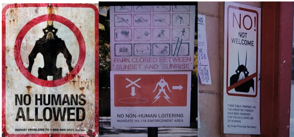
Example 4. Signs in the film (District 9, chapter 1)

Example four demonstrates how the film uses signs as symbols of reality in a transrealistic style. Here these new signifiers, based on the novum of a literal alien, must be signified on the basis of other signifiers in order to understand the meaning of the signs. In other words, these signs demand speculation between reality and the novum. However in this case, this speculation can hardly be described to be open to various interpretations as Johnson-Smith suggested. When these actual plaques are interpreted on the basis of their real life correspondents, the interpreter is once again faced with a one-to-one comparison metaphor instead of a vague symbol, for the interpreter is used to connecting such signifiers to certain real life signifiers.