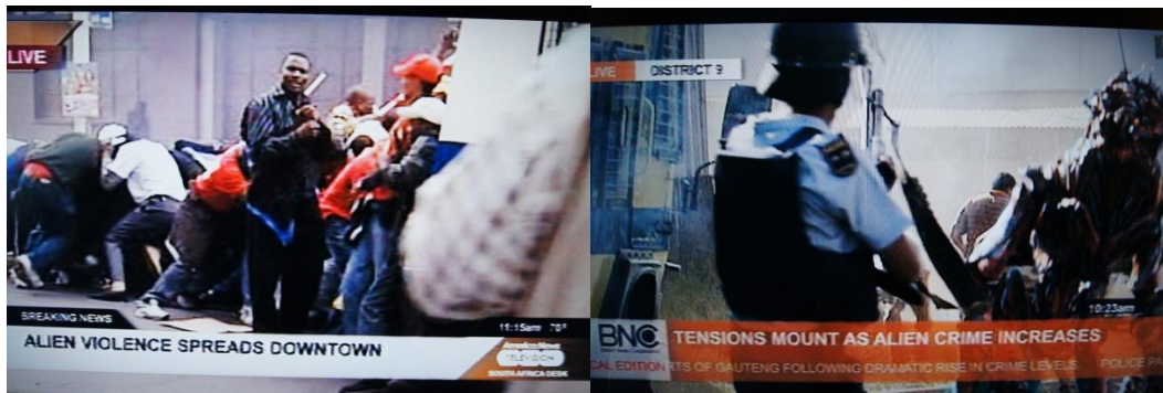
Example 3. The documentary style news footage (District 9: chapter 1)

In example three the plot and story of the film are supported by the use of these kind of news footage clips and headlines, which are typical for a documentary. These support the feeling of reality of the story and plot. These cinéma vérité tools are used in combination with the transrealistic style. The SF novum is linked to this realistic style, accomplishing the transrealism of the film; the second picture of example three shows an alien in news footage, shot with a hand-held camera, in a "real" life situation. Therefore, the film uses the cinéma vérité style, which we are accustomed to associating with realistic narration, as a tool to strengthen its transrealism. It reflects our own reality back to us by producing the transrealism via these realistic tools.