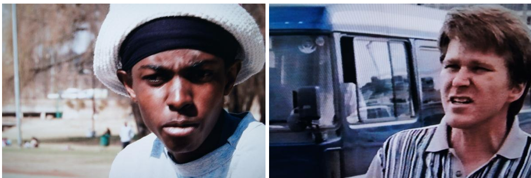
Example 1. The "real" people interviewed in District 9 (District 9: chapter 2)

The following three examples illustrate the documentary realistic style of the film. According to McConnel, hand-held cameras, actual locations and real people are typical for cinéma vérité style in contrast to Hollywood films (McConnel 1997). Example one illustrates the "real" people that are interviewed in "actual" locations. Example two illustrates the documentary use of "specialists" that are used as narrators of the film. Their purpose is to open up and bring forth the realistic issues surrounding and supporting the plot of the film. Example three illustrates the documentary style use of news footage.