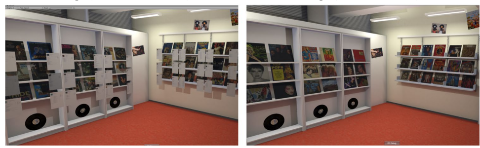
Fig. 2 Non-augmented (Group 1 & 3) vs Augmented (Group 2 & 4): Participant's View