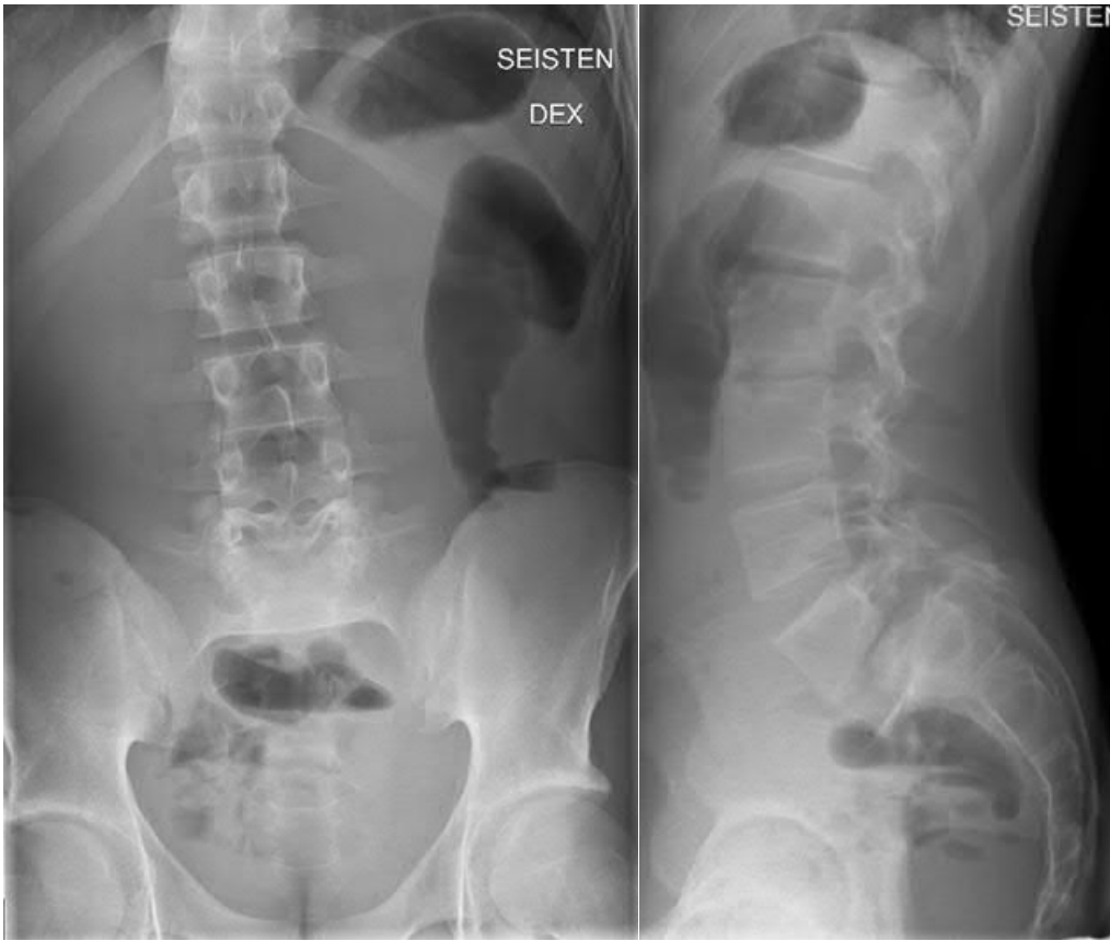
Figures 1-A and 1-B. A fifteen-year-old boy with a high-grade spondylolisthesis (slip 58%). Fig. 1-A Posteroanterior and lateral (Fig. 1-B) standing lumbar spine radiograph