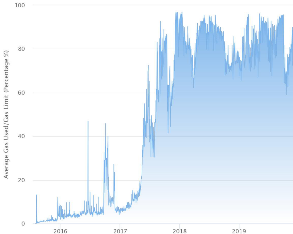
Figure 3: Ethereum network utilization frequently exceeds 95% since playable decentralized apps have been introduced at the end of 2017.

Click and drag in the plot area to zoom in