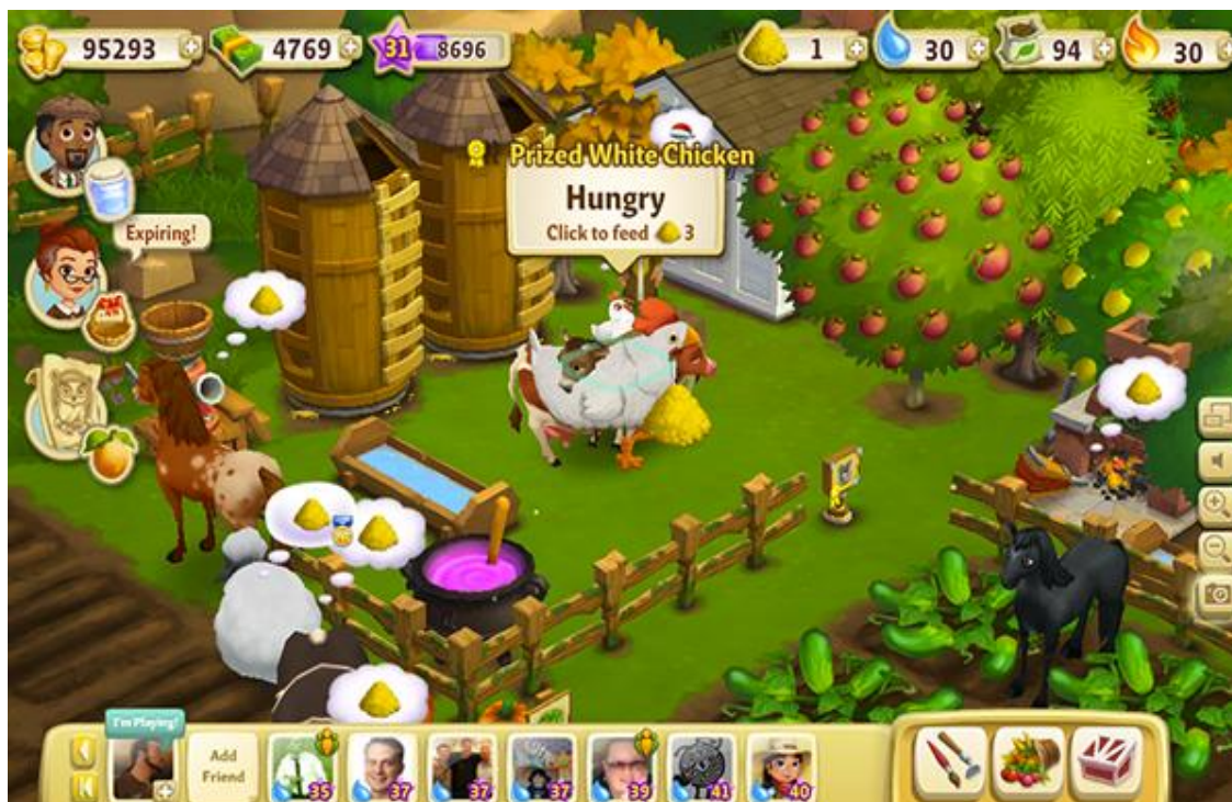
Figure 3. Nicolas Bourges. FarmVille 2 - User Interface. A “hungry” combination of a cow, a donkey and two chicken in the centre is probably a glitch.

failure, which made some researchers label them “challenge-free games” (Bogost, 2010). I would prefer to describe these games as “playful interfaces” which allow interaction with a high degree of freedom, and also, periodically offer difficult time management challenges (Serada, 2017).